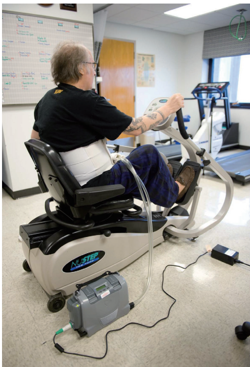
Figure 1 Syncardia Freedom Driver: compact external pneumatic pump which enables patients to be discharged from the hospital.